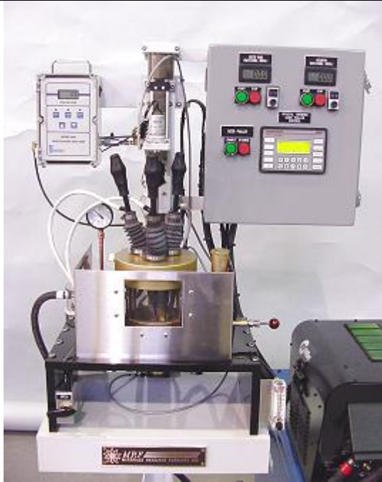
Tri-Arc melt chamber with crystal growing kit, rotating hearth, load lock, high frequency starter and oxygen monitor. The front welding glass has been removed for visibility.